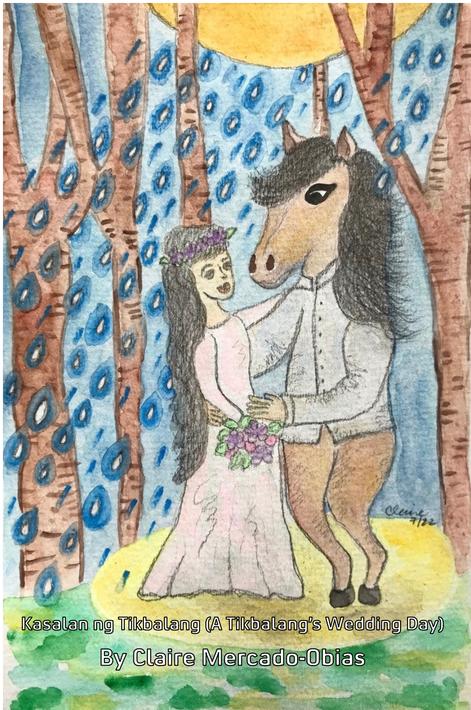
Kasalan ng Tikbalang (A Tikbalang's Wedding Day)