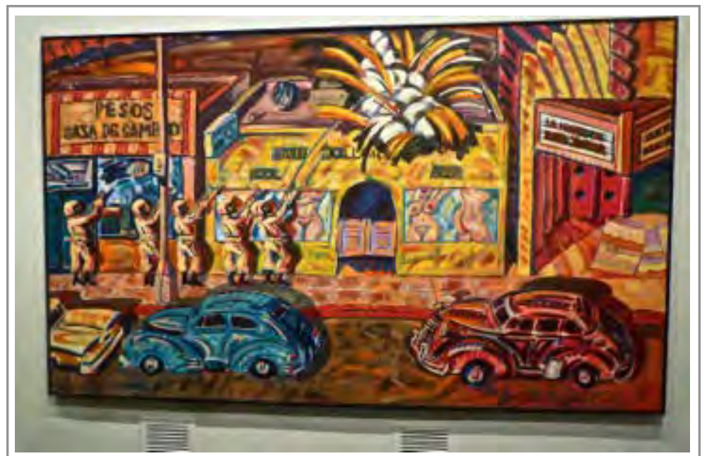
The Death of Rueben Salazar at the American Art Museum. I was a researcher on it when I had my Internship at the Smithsonian

And there are a ton of Art Museum. And ethnographic museums. And historical houses. And on and on. It's a city of museums, and that's just one reason why you should vote to bring WorldCon back to Washington, D.C..